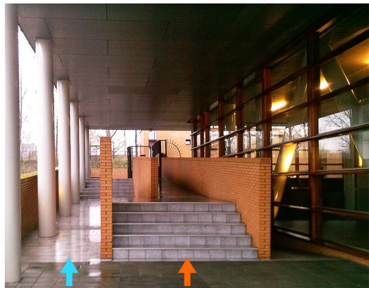
The stairs go towards the gate.

On the left the city council building, in between is the road towards water, on the right is our building.