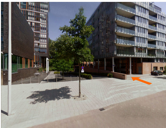
Jacques Veltmanstraat with the entrance and stairs.

Attention: there are two identical building complexes after the other. You need the one immediately after the municipal center building.